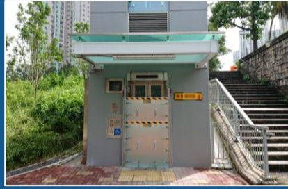
Two layer panel floodgate installed at Highway lift shaft