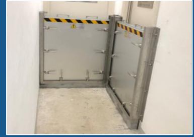
Two floodgates installed together in Flushing Water Tank and Pump Room