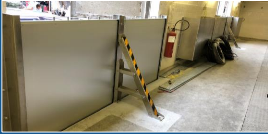
Double panel floodgate with water prevention hoods installed at CLP Power Substation