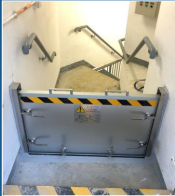
Single panel floodgate installed at staircase entrance of switch room