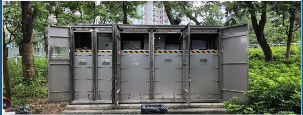
Floodgate installed at Highway lift pillar box