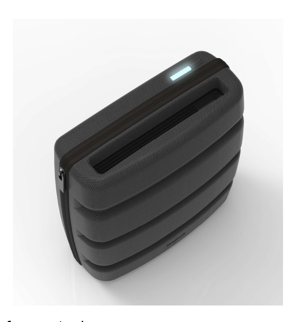
Shockproof case for use in the car: it can be easily installed on the headrest supports