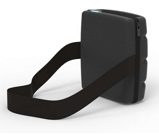
Shockproof protective case